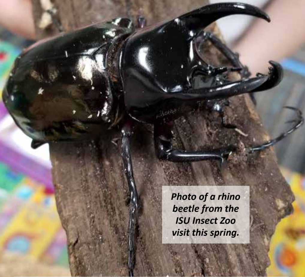
Photo of a rhino beetle from the ISU Insect Zoo visit this spring.

North Liberty Library www.northlibertylibrary.org